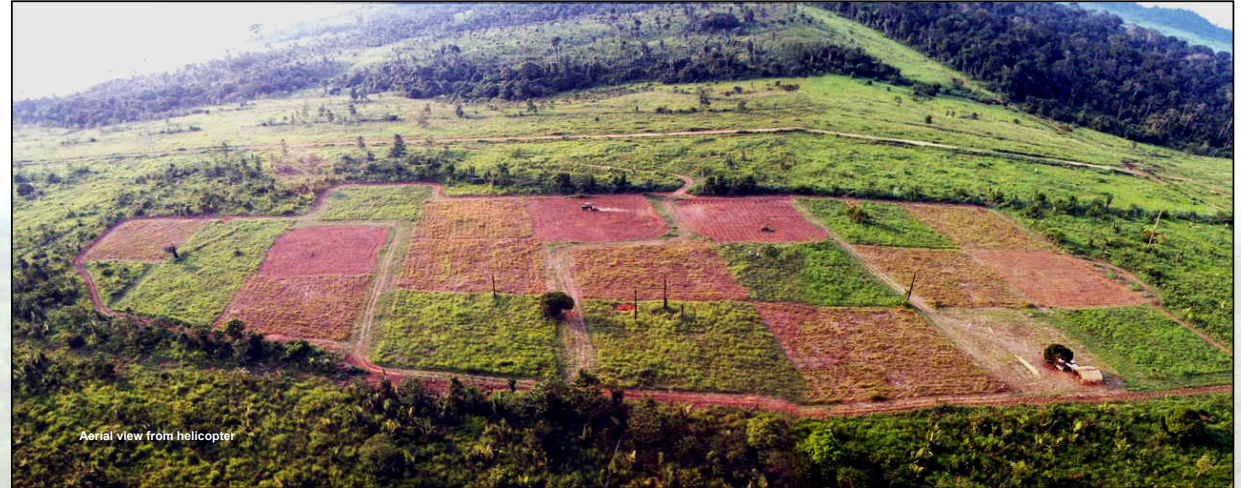
Aerial view from helicopter

This aging pasture is poised to play a dominant role in the biogeochemistry of the Amazon Basin in the future. In the near term, intensification is likely to focus on making extant pastures more productive through a variety of treatments including disking, and replanting of pasture grass, perhaps following the planting and harvesting of a cash crop such as rice or soybeans. In the longer term, some of the pastures may be permanently converted to row-crop farms that will concentrate on producing lucrative export crops.